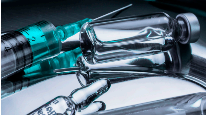
Vaccine & Pharmaceuticals