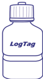
Glycol Buffer Not Included